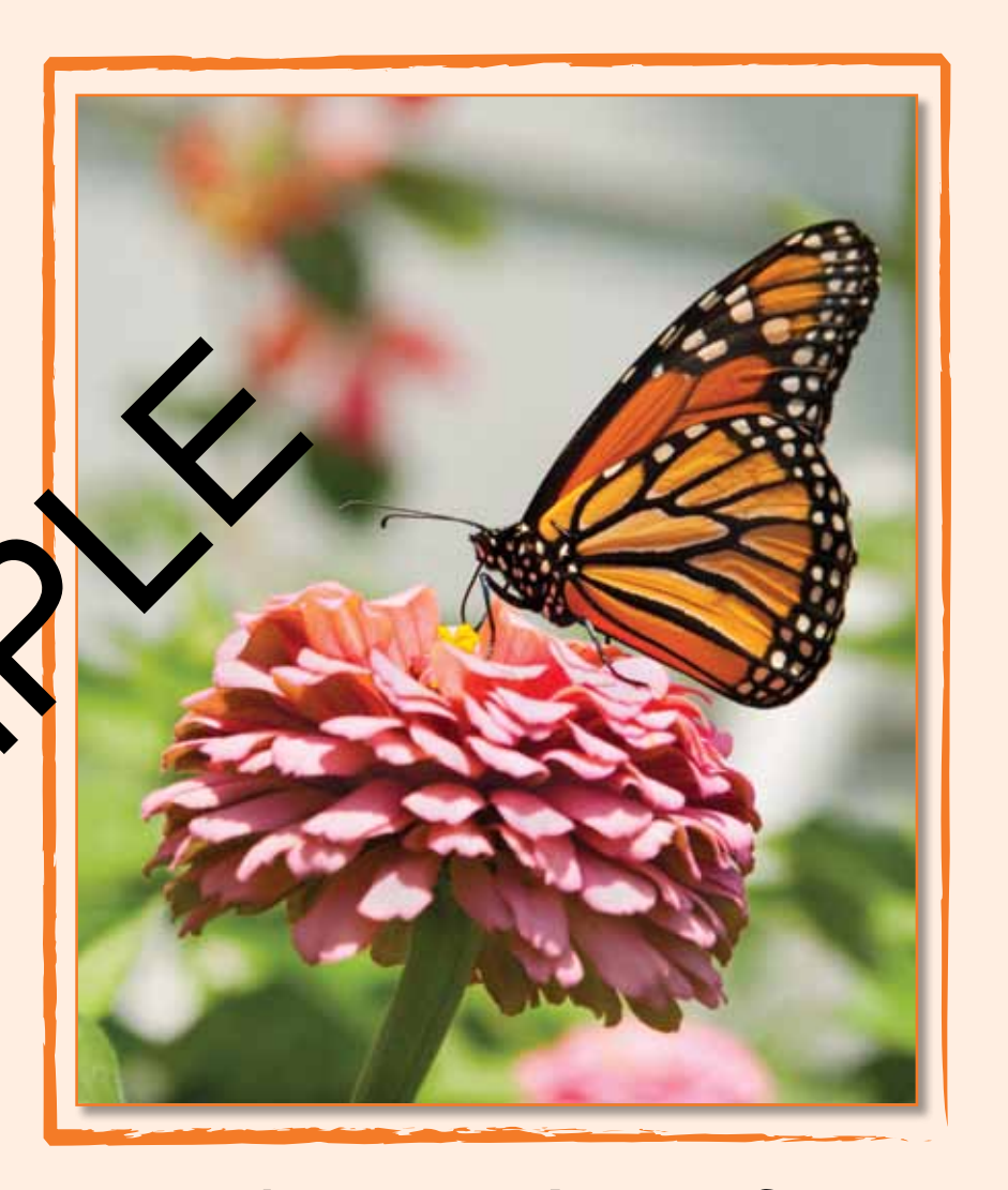
First, there is a butterfly.