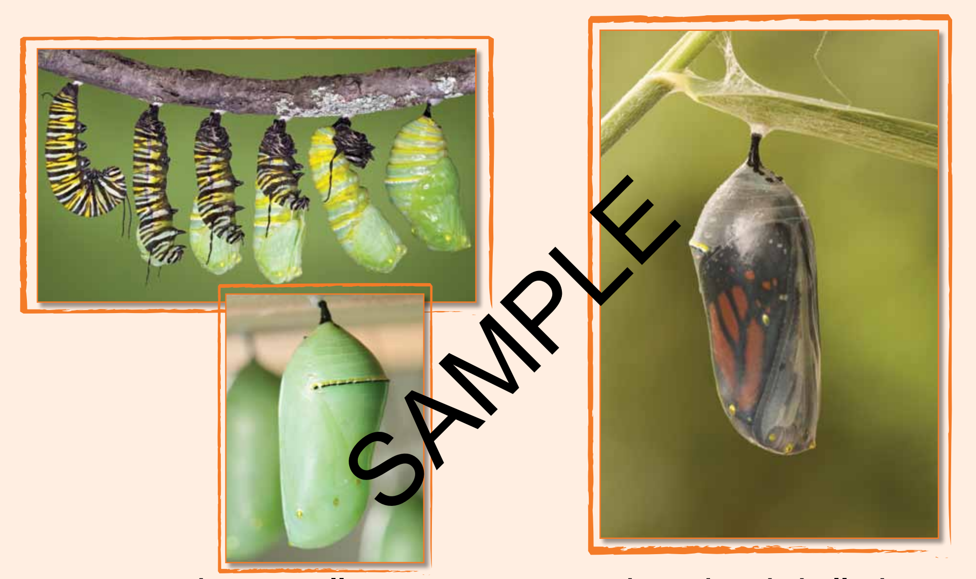
Later, each caterpillar becomes a pupa.