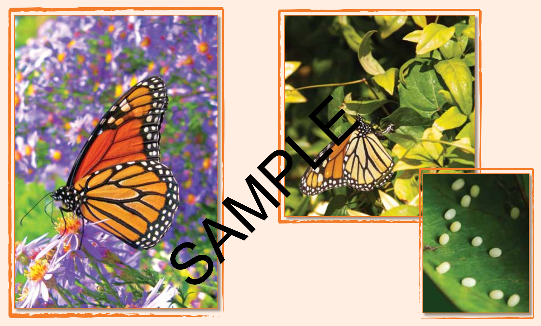
It will soon be a mother.